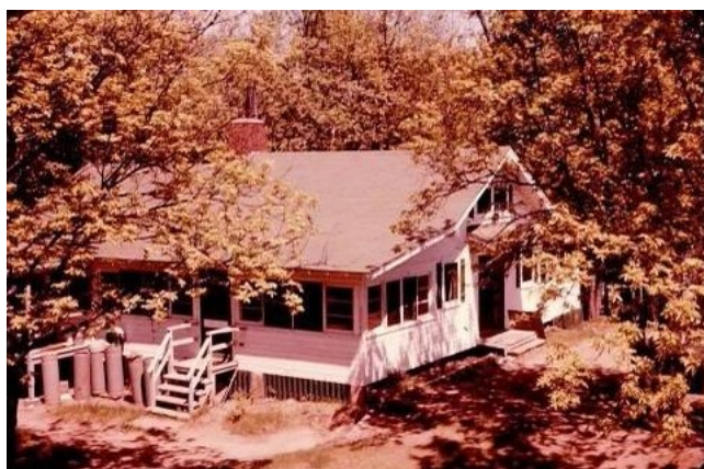
Original dining hall