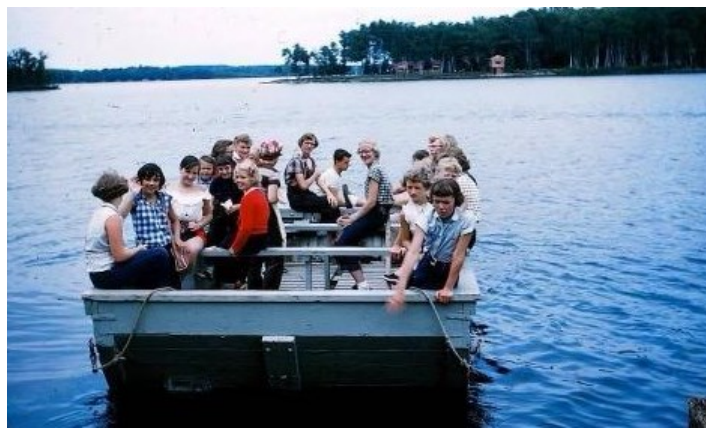
A group of young campers crossing the lake to the island.